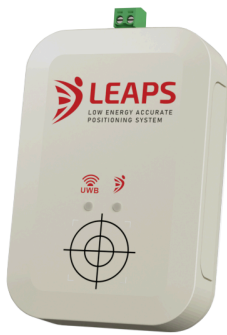
Figure 1: The Front view of the device

This document provides technical details of the LC4A device. The LC4A device is a versatile hardware solution designed to function as either an Anchor Node (AN) or a Tag Node (TN) within a Real-Time Location System (RTLS). Its flexibility and adaptability make it ideal for various tracking and monitoring applications.